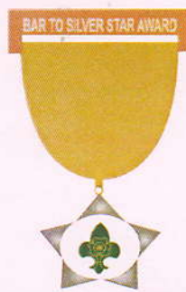
Bar to Silver Star Award