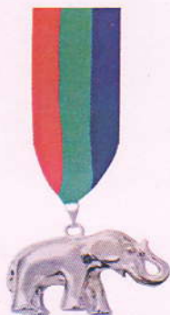
Silver Elephant Award

Circular No. : 51 / 2016 Dated : 28 th April, 2016