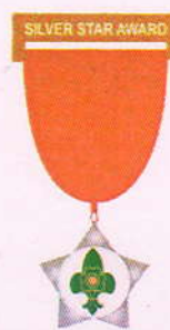
Silver Star Award